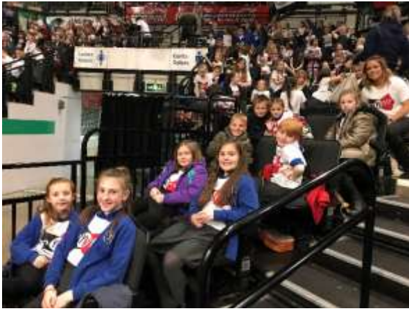
At Sheffield Young Voices 2019