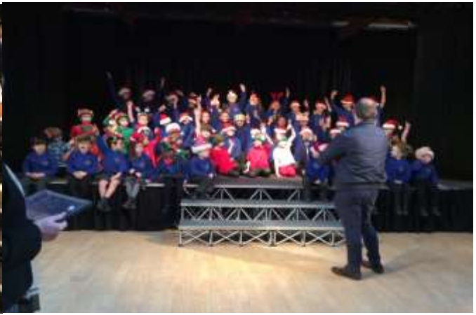
Singing the Stray fm Christmas song 2018